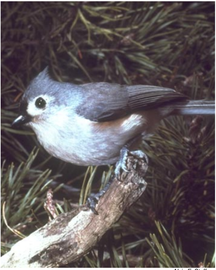
Alvin E. Staffan

doned woodpecker holes. However, some titmice will excavate their own cavities and a few pairs may occupy bird houses (Campbell 1940, Mathena et al. 1984, Trautman 1940). Most nests are placed at heights of 10–25 feet, although a few have been found at heights of only 3–5 feet in fenceposts while others may be 40–50 feet above the ground in tall trees.